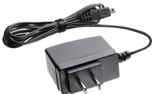
AC Wall Charger